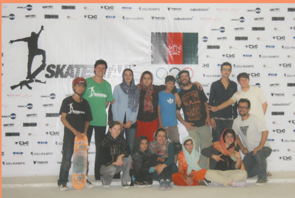
THE SKATEISTAN STAFF