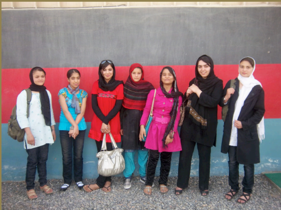
JOURNALISM CLASS AND FRIENDS

AT THE END I WANT TO JUST MENTION THE MAIN PROBLEMS OF THE YOUNG GENERATION IN AFGHANISTAN: NO FACILITY FOR JOBS, ECONOMIC PROBLEMS, FAMILY PROBLEMS AND EDUCATION PROBLEMS. I AND EVERY YOUNG MEMBER OF THIS POOR COUNTRY HAVE THIS HOPE AND REQUEST FROM THE GOVERNMENT OF AFGHANISTAN TO PLEASE PROVIDE THE BEST FACILITIES FOR EVERY MEMBER OF THIS COUNTRY SO THAT THEY LIVE IN COMFORT AND SPEND THEIR LIVES IN HAPPINESS AND SAFETY.